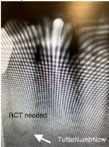
Pre-op: Tooth #29